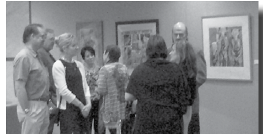
MCAC members, artists and guests attending the CSUF Opening Reception