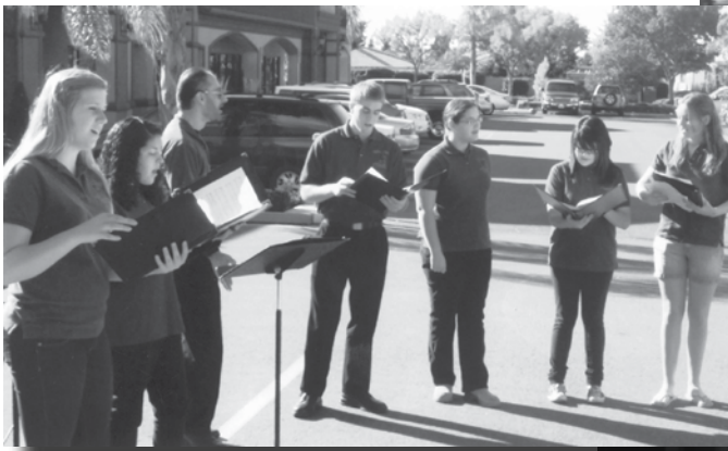
Madera South High School Choir performed