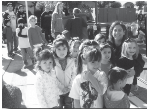
Michelle's School of Dance charmed the guests