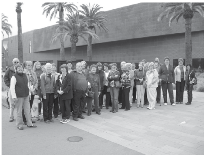
The group ready to enter the museum.