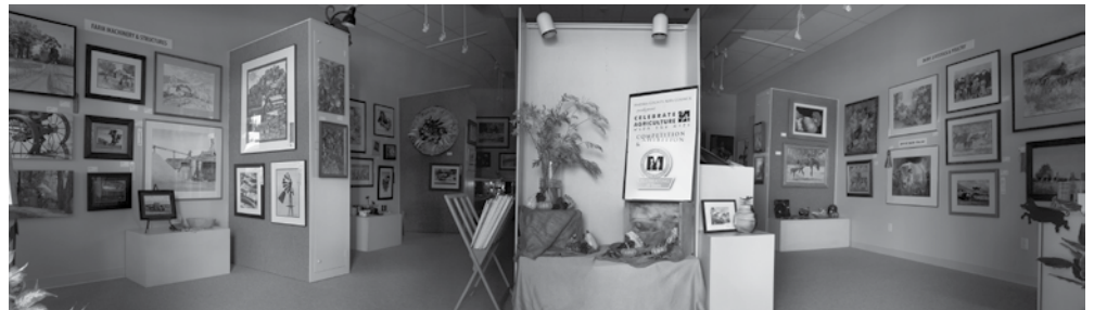
Celebrate Agriculture with the Arts 2013 Exhibition at Circle Gallery