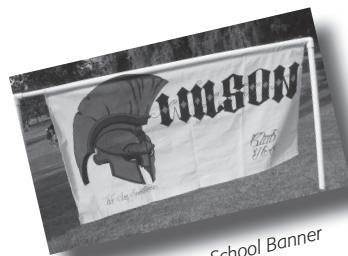
Wilson Elementary School Banner