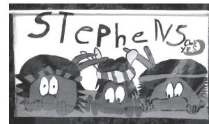
Stephens Elementary School Banner