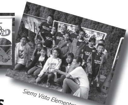
Sierra Vista Elementary School Banner